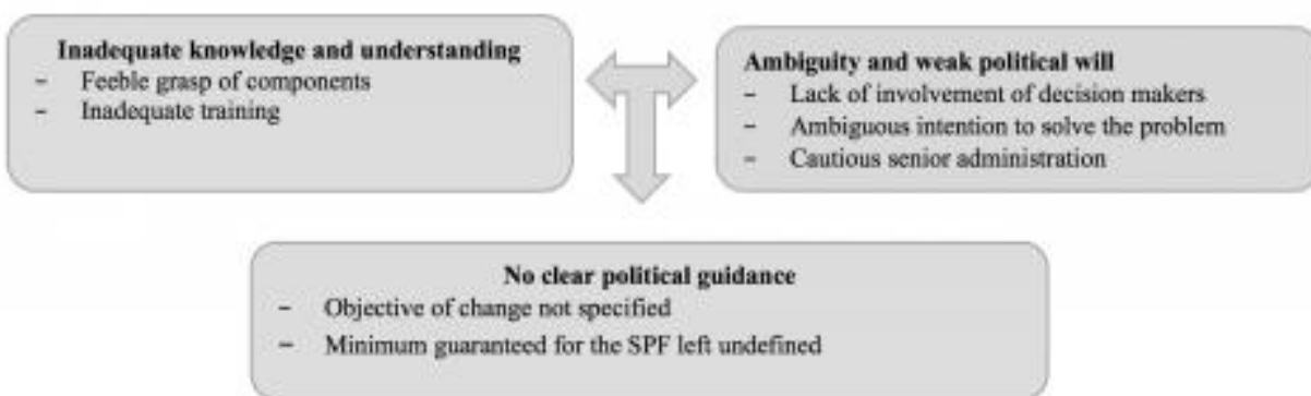
Figure 4. A context conducive to a 'non-design' type of formulation in Burkina Faso

33In short, the stakeholders lacked guidance and clarification on the changes desired by the political decision makers and the senior administration. This situation, the result of a lack of knowledge of social protection issues and an ambiguous political will, favoured the emergence of a context of formulation conducive to 'non-design' (Figure 4).