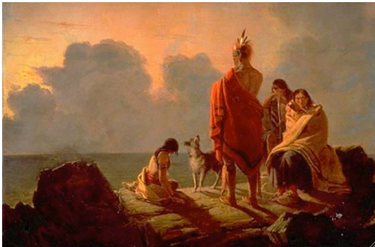
Figure 4: The Last of His Race , Tompkins Matteson (1847).