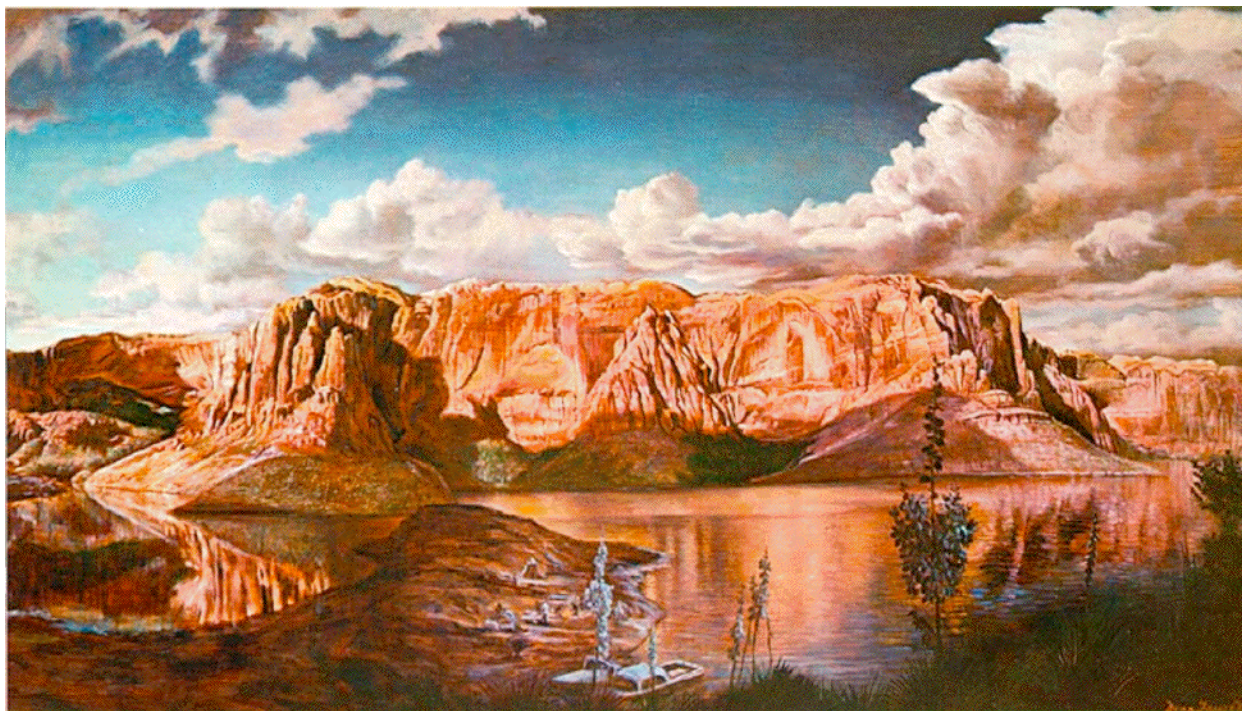
Fig. 6: Campsite at Dawn , by Dean Fausett (b. 1913). Oil on panel, 48" x 96," of Lake Powell, Utah.

Rockwell's Glen Canyon Dam canvas forces viewers to see the dam from the Indian perspective, both physically and philosophically. The dam is a tourniquet, a technological constraint that any fish remaining downstream will not get past. From the Indian perspective, the engineering achievement may be considered to be manipulative and abusive, a sacrilege, a