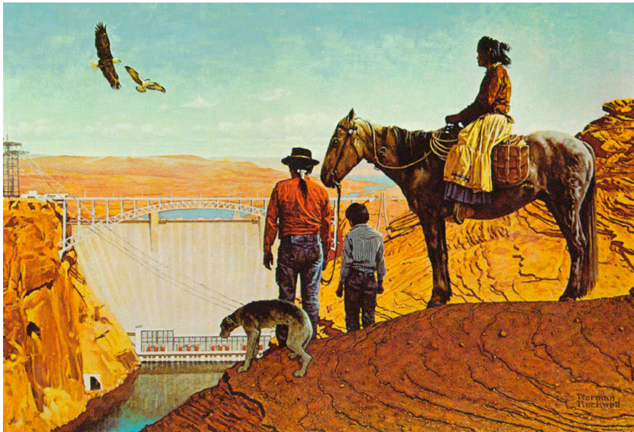
Figure 3: Glen Canyon Dam , by Norman Rockwell (1895-1978). Oil on canvas, 51” x 77,” of Glen Canyon Dam, Arizona.

a corpse in before it is buried.) As the film advances, a fantasy unfolds slowly. A family of four camps and romps through the wonders that are Lake Powell. The original classical score, composed for the film, segues into jazzy riffs when footage pops onscreen of fish being dropped into Lake Powell from the air by floatplane. Very soon, a mounted Indian appears dressed in red shirt, white pants, and a white headscarf tied behind. The solemn voiceover reminds viewers that this is the “land of the Navaho.” The Indian looks approvingly at the skiers being towed behind a boat below. “Into his land came Lake Powell, which he has woven into his pattern of ancient ways.” He leans over on his horse from atop a precipice and watches the family; he reappears at film’s end as if to assure viewers he is still content with his ancestral homeland. When the imagery and language move to the dam, the narrator’s voice waxes sonorous and inspirational. “Impressive in its silent strength, the dam, with its ten million tons of concrete, rises 710 feet from sandstone bedrock.”