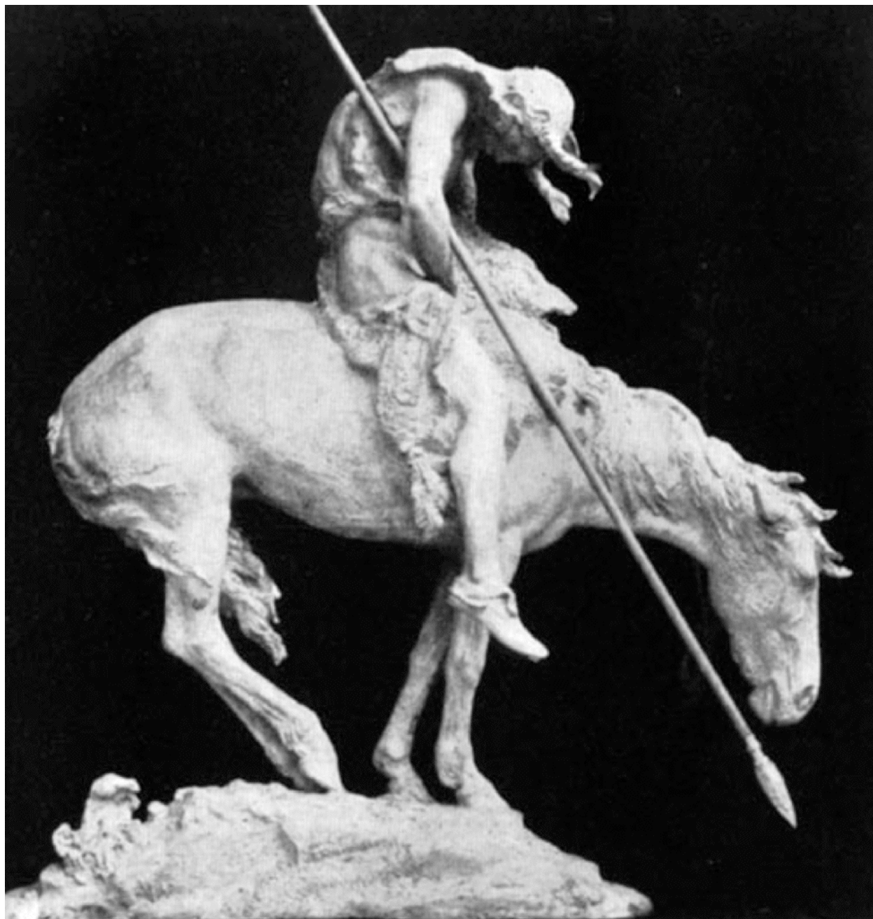
Figure 5: The End of the Trail , James Earle Fraser (1915). Plaster, 18'h.

Collection may be seen as one cultural text connected by thin membranes. Having established the artistic contexts, then, one may more narrowly refine the critical focus.